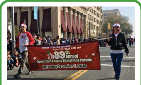
Digital image / http://downtownfresno.org, n.d. Web / 01 Nov 2018 / http://downtownfresno.org/christmasparade/

Contact: Old Town Clovis Kiwanis at (559) 270-0929 www.otckiwanis.org